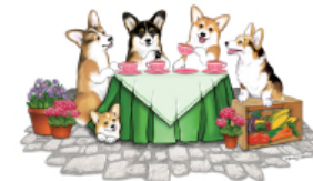
Corgis and the Garden State

There will be a 1-hour lunch break at committee/judge discretion.