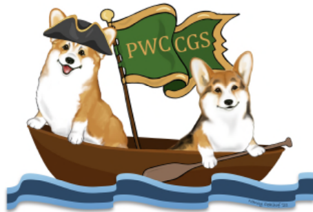
Cross the Delaware to the Garden State Specialty

27th & 28th Annual Specialty Shows 19th & 20th Independent Specialty Shows