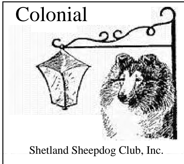
(Licensed by the American Kennel Club)